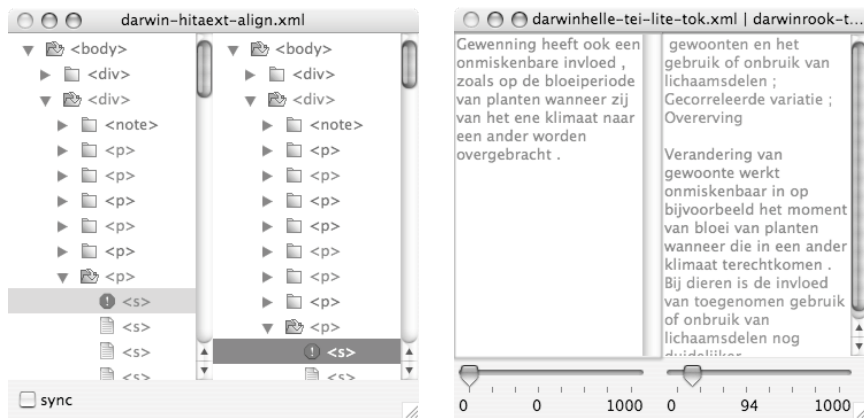
Figure 5.2: Screen shot of Hitaext, the tool used for aligning text segments

remain manageable because the user can expand or collapse arbitrary parts of the document tree. In addition, irrelevant elements can be either skipped or hidden completely by configuring the style sheet.